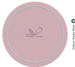
Color: Dusty Rose

kreatfunk KREATFUNK GMBH KREITZBERGSTRASSE 10A 10245 BERLIN, GERMANY WICHARGE Stone KFKE123 Assembled in China P.O. 08